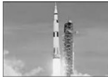
1967 Saturn V